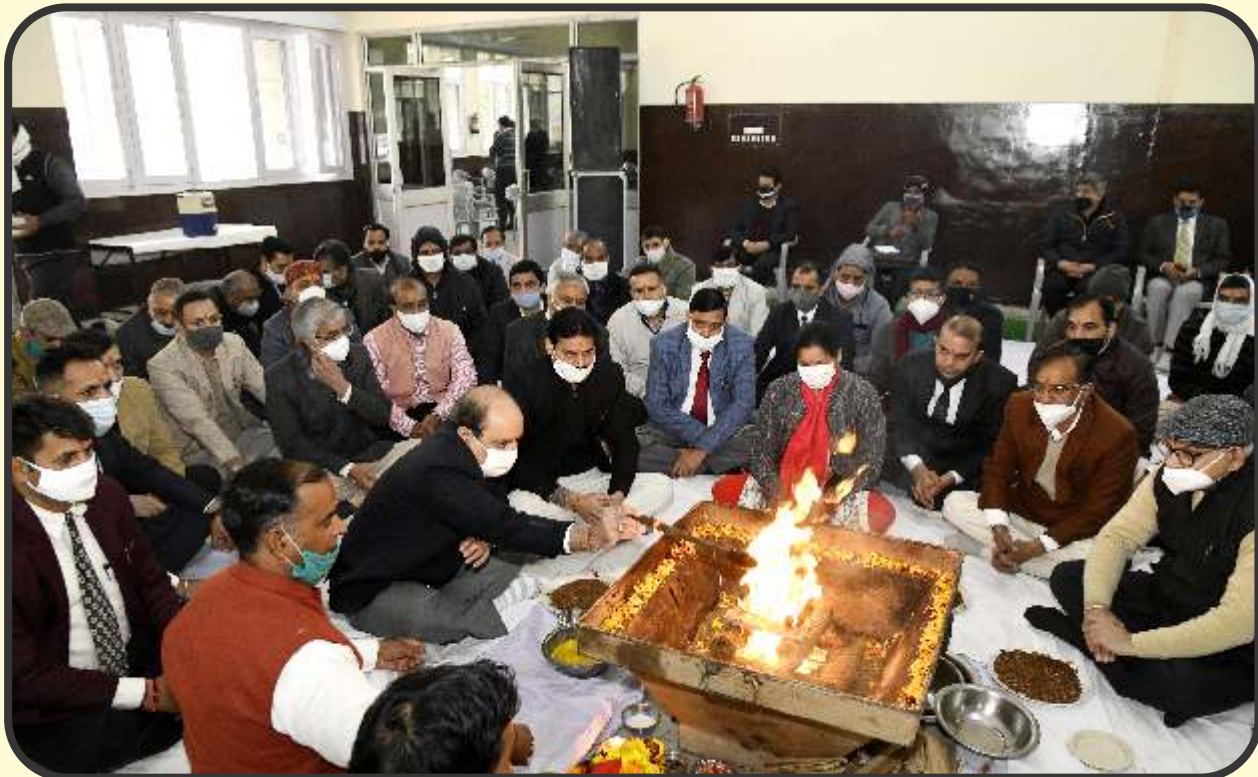
Foundation Day of Kurukshetra University, 11th January 2021